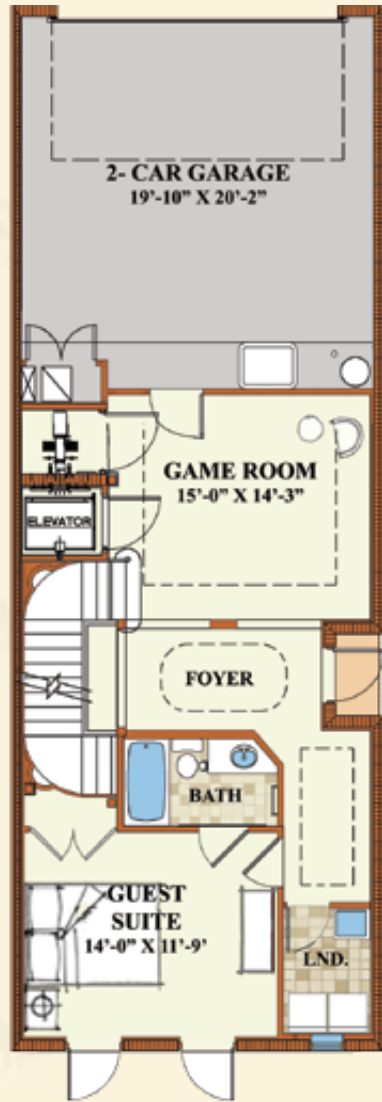
Model B First Floor